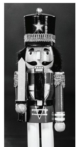
Proceeds benefit the dancers in our community.

Closed after the Saturday 4 p.m. show's intermission.